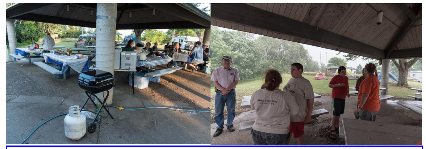
Above left: We didn't have the big club picnic, but the crew got fed. Right: It wouldn't be Field Day without some special weather. Bottom left: The CW station after the storm. Right: Mert (WØUFO) at the CW station. All Field Day photos courtesy of Dawn Holmberg, WXØZ